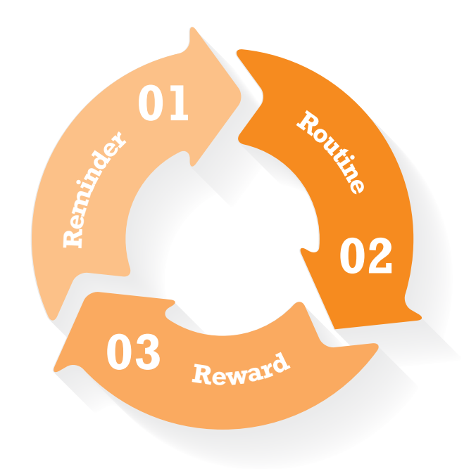
The 3 R's of Habit Formation

Psychologists tell us that changing or forming a habit follows a <u>3 step pattern</u> – Reminder, Routine, Reward. Think about these steps in the context of changing assessment practices in your school. How can you build in reminders? How can you make the changes routine? And what might be the rewards?