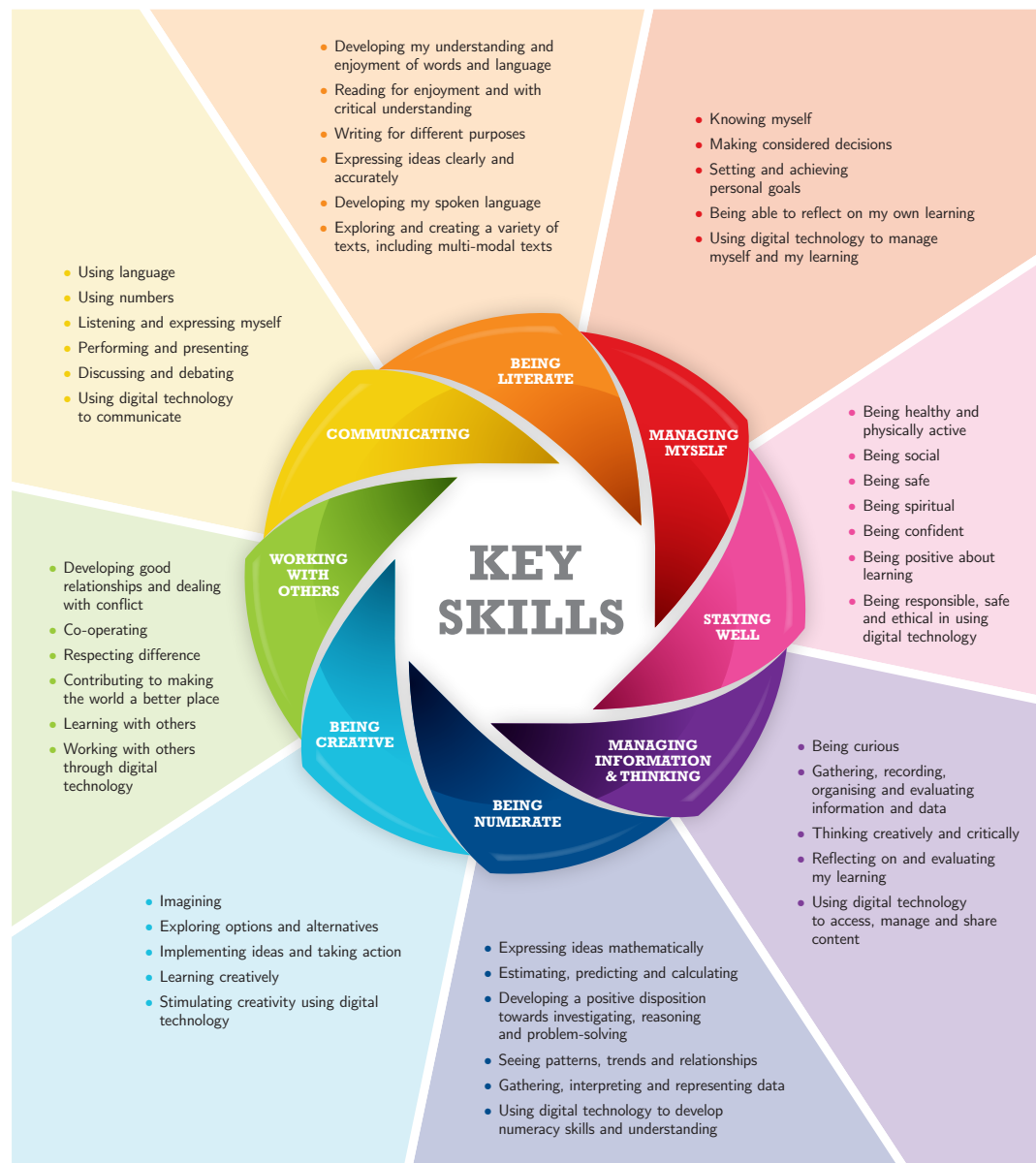
Figure 1 below illustrates the key skills of junior cycle

In addition to their specific content and knowledge, the subjects and short courses of junior cycle provide students with opportunities to develop a range of key skills. This course offers opportunities to support all key skills but some are particularly significant.